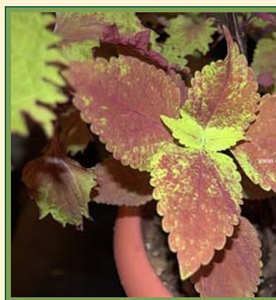
'Alabama Sunset' Co

The other coleus I'm overwintering is 'Alabama Sunset'. 'Alabama Sunset' has some similar coloring to Henna in the red but the green is much more of a lime green and mixes with the red on both sides of the leaves with a mottled variegation. I saved two cuttings of this coleus and planted them in the same pot for space conservation reasons. When the last frost date gets close I'll make cuttings of the 'Alabama Sunset' and plant them outdoors.